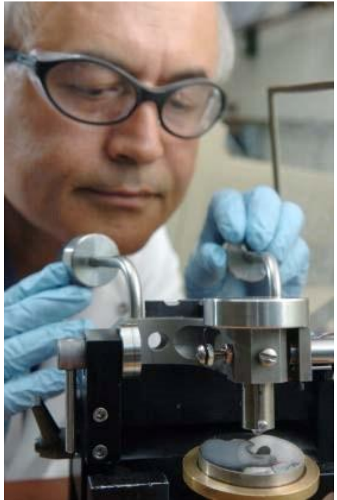
Argonne researcher Ali Erdemir performs a friction test on a metal disc coated with a solution of motor oil with nanoboric acid particles.

Reducing the size of the particles to as tiny as 50 nanometres in diameter – less than one-thousandth the width of a human hair – solved a number of old problems and opened up a number of new possibilities, Erdemir said. In previous tests, his team had combined the larger boric acid particles with pure poly-alpha olefin,