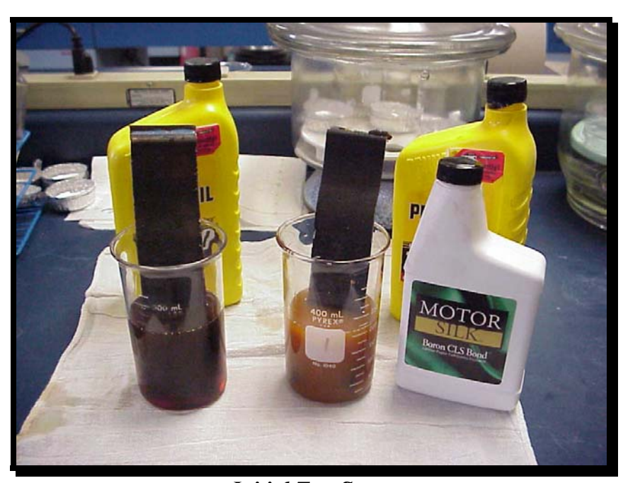
Initial Test Setup