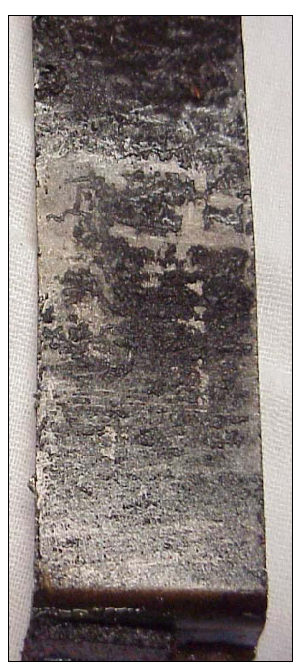
Pennzoil With Motor Silk Test Coupons Before After